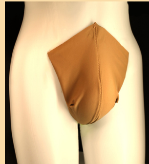
Modesty Wear: Hammock by The Modesty Shop